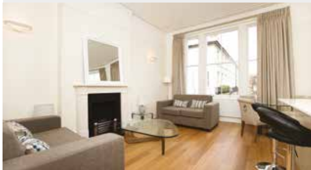
LET Marloes Road, W8 £525 per week