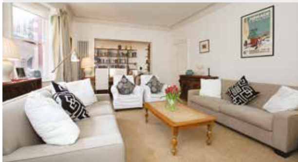
LET Wynnstay Gardens, W8 £1,595 per week