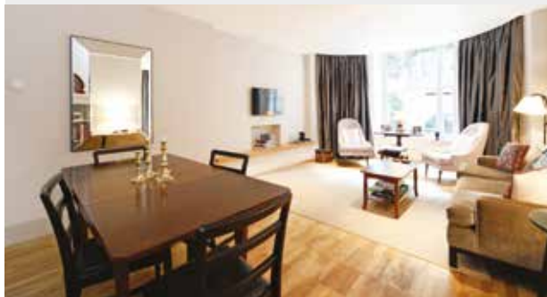
LET Hyde Park Square, W2 £825 per week

Our Lettings Department has had the most successful spring and are looking to continue this into the summer. So if you are considering renting your property please call, email or pop into one of our offices to book a FREE valuation.