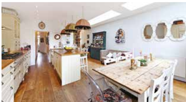
LET Oxford Gardens, W10 £1,350 per week