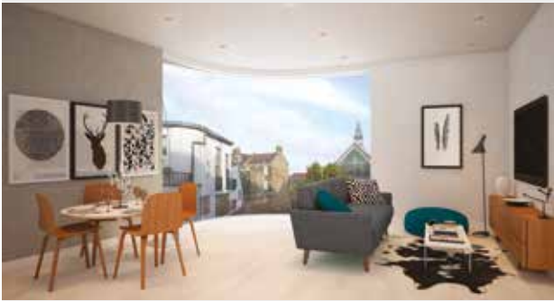
SOLD The Coachworks, NW10 £680,000