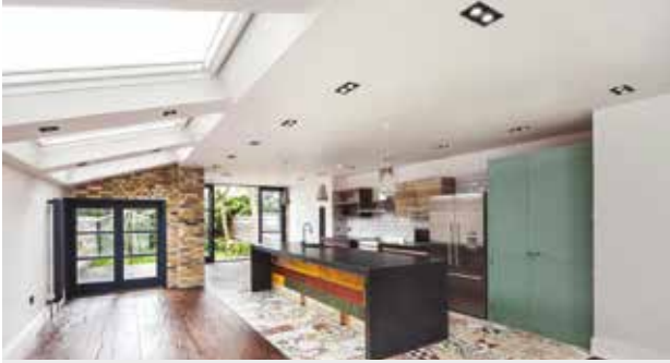
SOLD Harvist Road, NW6 £2,795,000