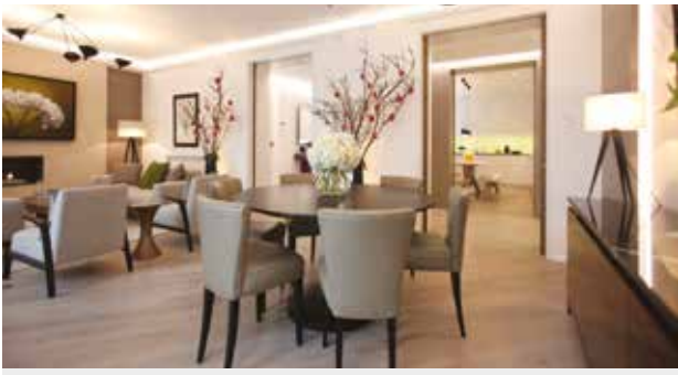
SOLD Iverna Court, W8 £4,350,000