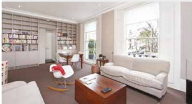
LET Pembridge Villas, W11 £900 per week