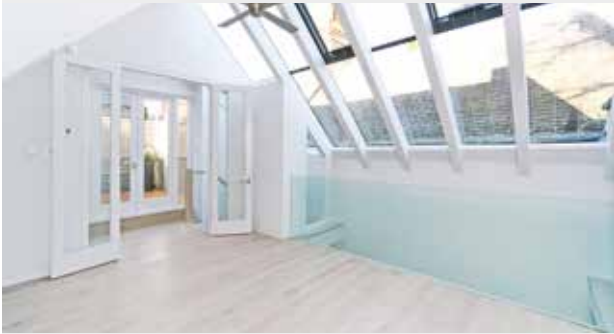
SOLD Scarsdale Studios, W8 £1,695,000