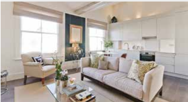
SOLD Westbourne Pk Rd, W11 £1,100,000

Our Sales Department has achieved some outstanding results for our clients. If you are considering selling your property and would like honest, accurate advice please call or email us to book a FREE valuation.