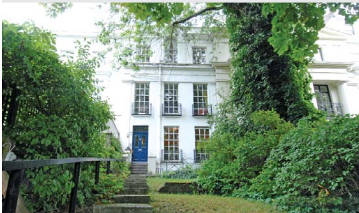
SOLD Holland Park Avenue, W11 £3,750,000