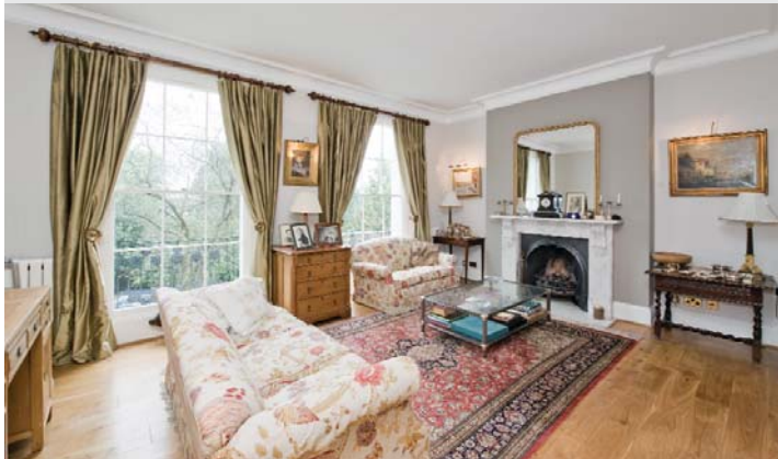
SOLD Campden Hill Square, W8 £5,850,000