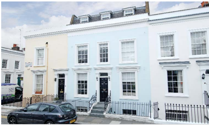
SOLD Callcott Street, W8 £1,595,000