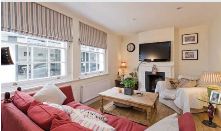
SOLD Radley Mews, W8 £975,000

Our Sales Department has been extraordinarily busy and achieved some outstanding results for our clients. If you are considering selling your property and would like honest, accurate advice please call or email us to book a FREE valuation – our contact details are on the back page.