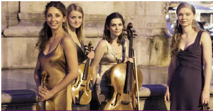
As part of the KCMS season of concerts the Benyounes String Quartet will play at Leighton House on Thursday 21 February