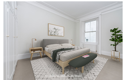
This photo has been virtually staged