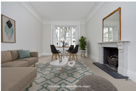
This photo has been virtually staged