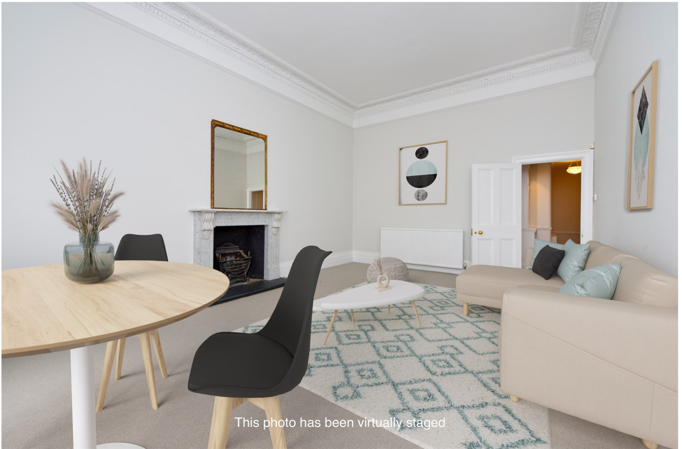
This photo has been virtually staged