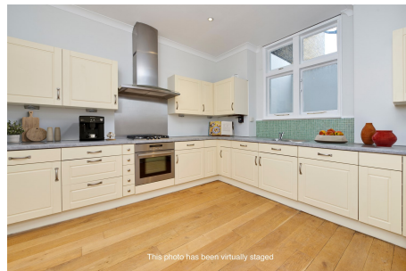
This photo has been virtually staged