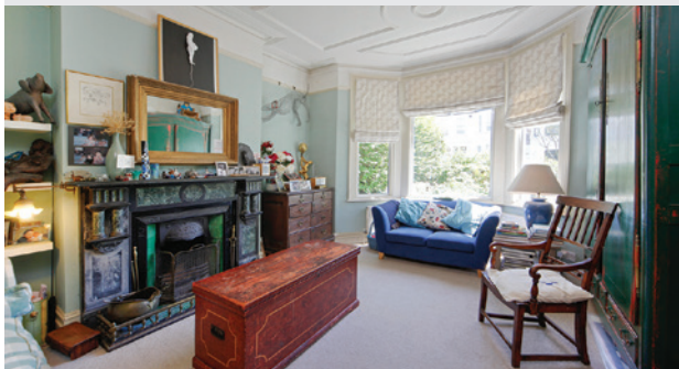
SOLD Furness Road, NW10 £1,295,000