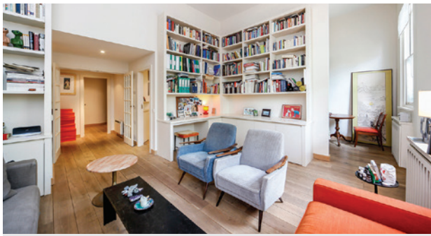
SOLD Ladbroke Square, W11 £1,150,000