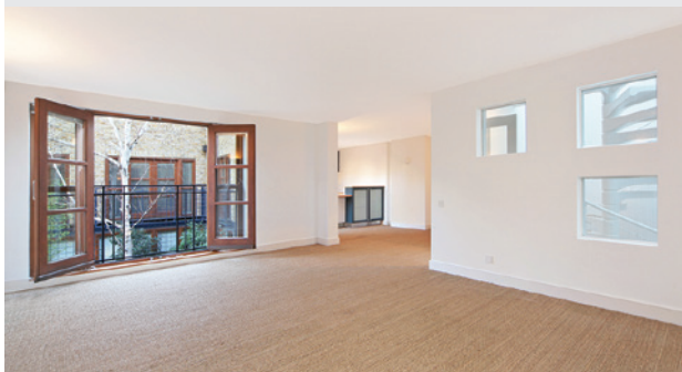
SOLD Golden Cross Mews, W11 £1,900,000