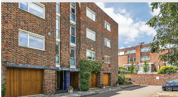
SOLD Woodford Square, W14 £2,500,000

Our Sales Department has achieved some outstanding results for our clients in 2016. So if you are considering selling your property and would like honest, accurate advice please call or email us to book a FREE valuation.