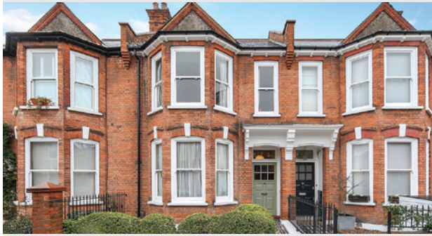
SOLD Kelfield Gardens, W10 £2,250,000