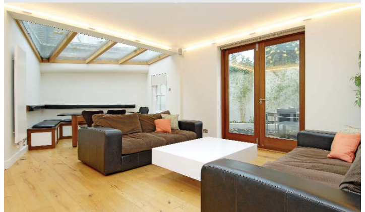
LET Pembridge Crescent, W11 £1,100 per week