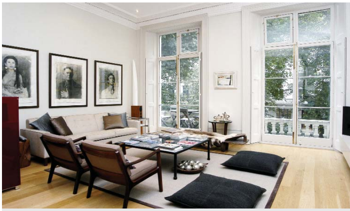
SOLD Queens Garden, W2 £2,325,000