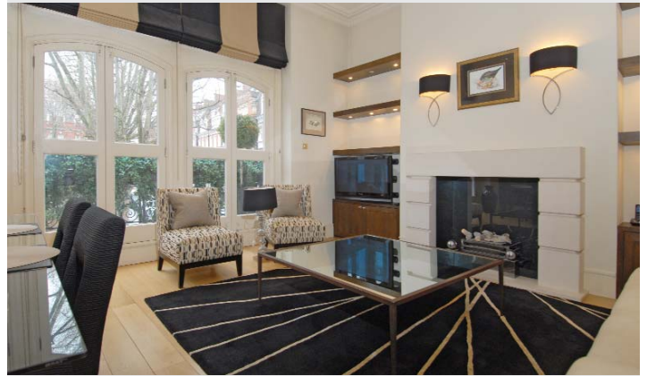
LET Kensington Court, W8 £800 per week