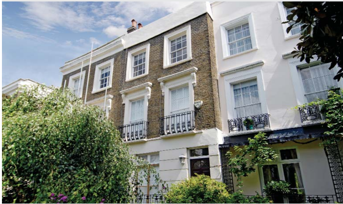
SOLD Northumberland Place, W2 £2,220,000