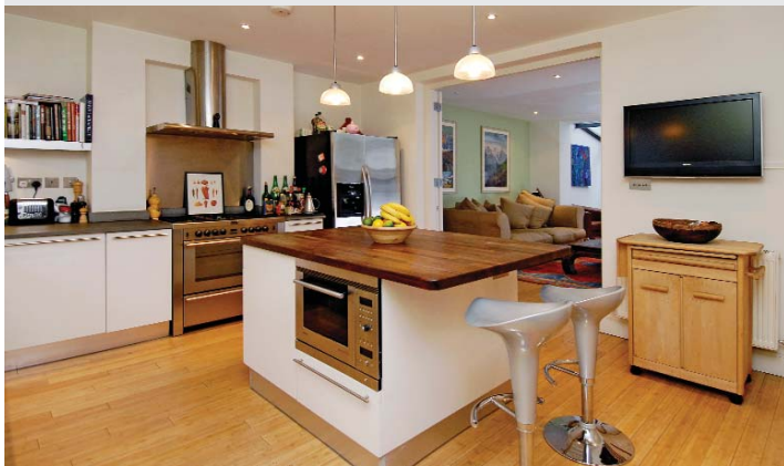
SOLD Westbourne Park Road, W2 £2,400,000