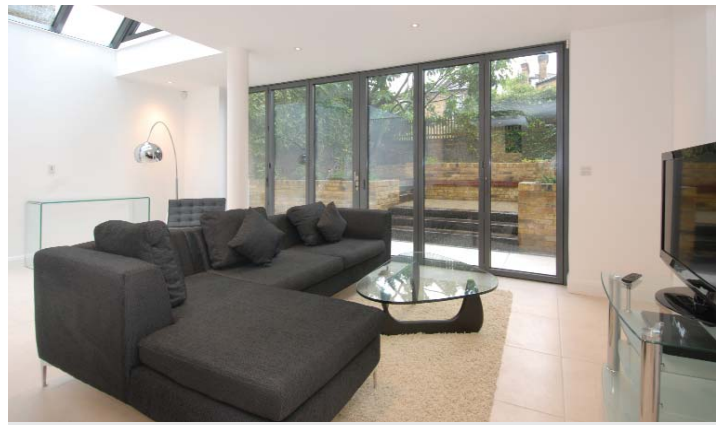
LET St Helen's Garden, W2 £800 per week