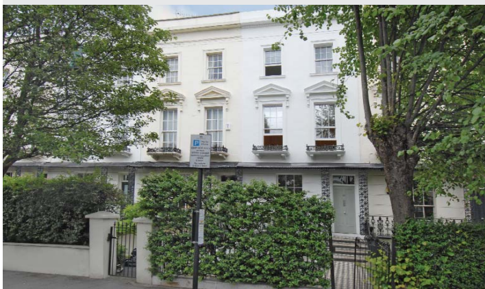
SOLD Chepstow Road, W2 £2,100,000

Our Sales Department has achieved some outstanding results for our clients. If you are considering selling your property and would like honest, accurate advice please call or email us to book a FREE valuation.