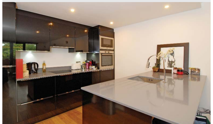
LET Ink Building, W10 £475 per week

Our Lettings Department has had the most successful ever start to the year and are looking to continue this run into the summer. So if you are considering renting your property please call, email us or pop into one of our offices to book a FREE valuation.